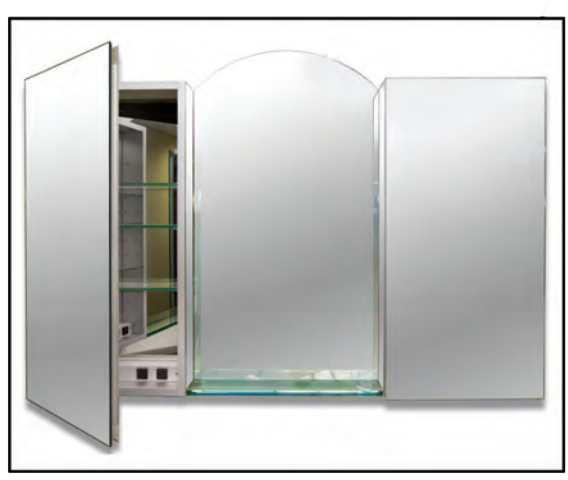
2 Medicine Cabinets with Arched Wall Mirror and Shelf Centered Between the Cabinets. Cabinets are Flat with Polished Edges and Electric.