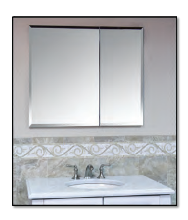
\label{eq:medicine} \begin{tabular}{ll} Medicine Cabinet with 1 Box and 2 Staggered \\ Door Sizes, $3/4"$ Beveled Edges. \end{tabular}