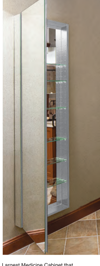
Largest Medicine Cabinet that Century Offers. 70" Cabinets are Available in all Widths and Applications. Surface Mount, Electric, Recessed or Semi -Recessed.